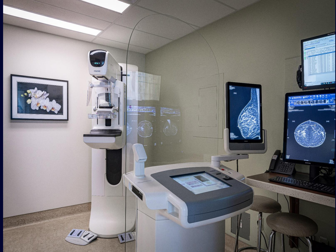
New tomosynthesis machine at the CRID

In 2020-2021, the CRID underwent renovations to accommodate a new stereotactic breast biopsy table that is designed for efficiency and comfort. This state-of-the-art table allows the patient to rest face down during a biopsy to reduce adverse physical reactions and conceal the procedure from the patient's view. Optimal positioning for carrying out exams and a better patient experience are a few of the many positive outcomes.