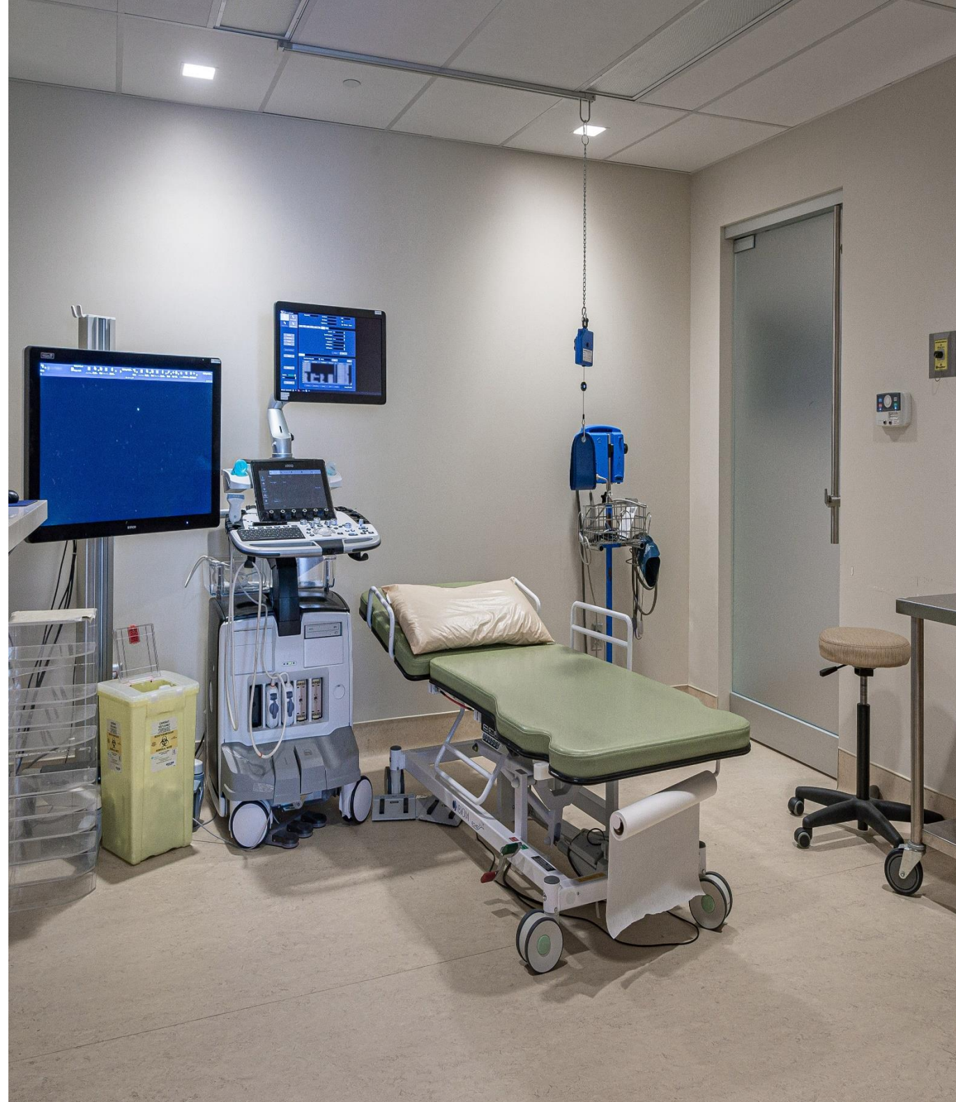
New, third ultrasound room at the CRID

In 2021-2022, the CRID saw a 13% increase in the number of patients from 2020-2021. A slight decrease in 2022-2023 was due to staffing issues.